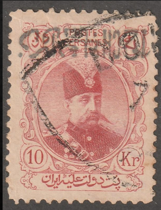
Black surcharge inverted on top