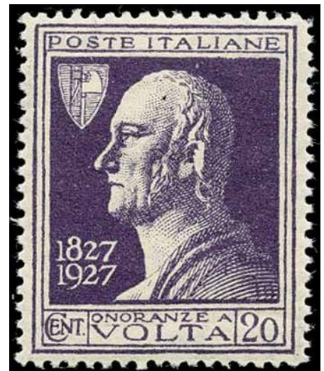
Lot 697: Vitt. Emanuele III - Alessandro Volta c.20 violet (different colour) - Sassone 2022 n.210A

Among the 1,218 lots of philately and postal history there are some rarities from Ancient Italian States and Foreign countries on sale for the first time. The sectors relating to the Kingdom, Occupations, Military Mail and Colonies are particularly developed.