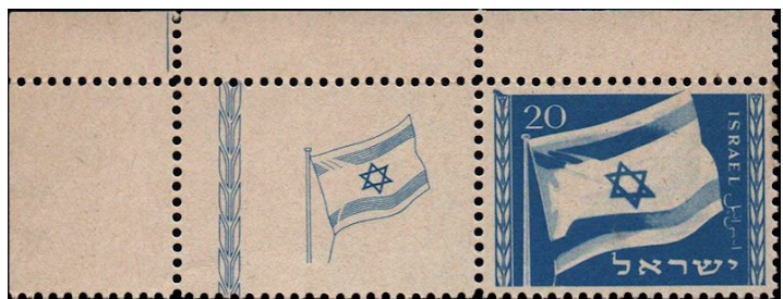
Israel, Scott Nr 15 (1948)