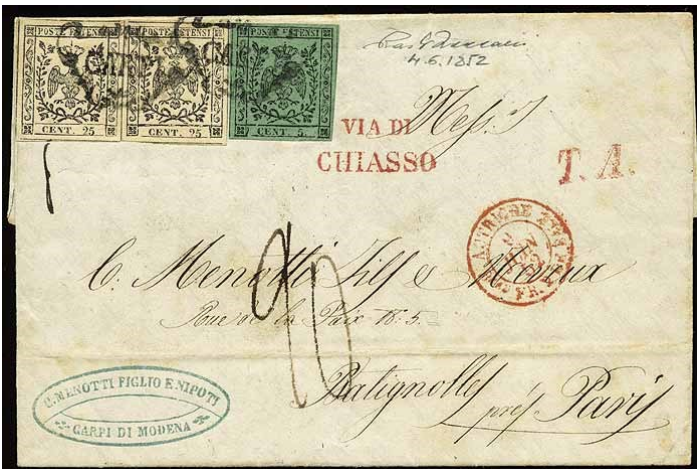
Lot 84: Letter with text from Carpi to Batignolles near Paris, dated 4.6.1852

Viewing the lots is also a great opportunity: we will be in Milan on 20 April, but we will be waiting for you in our offices already from 12 April by appointment.