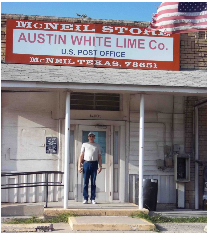
IPDA Newsletter May 2023

He can be contacted by email at: sandmannusa@verizon.net