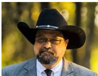
One mean hombre .

Hello everyone and welcome to May! Spring is upon us here in Texas and so are the big thunderstorms and hailstorms. I am thinking of wrapping the house and cars with bubble wrap until June or so.