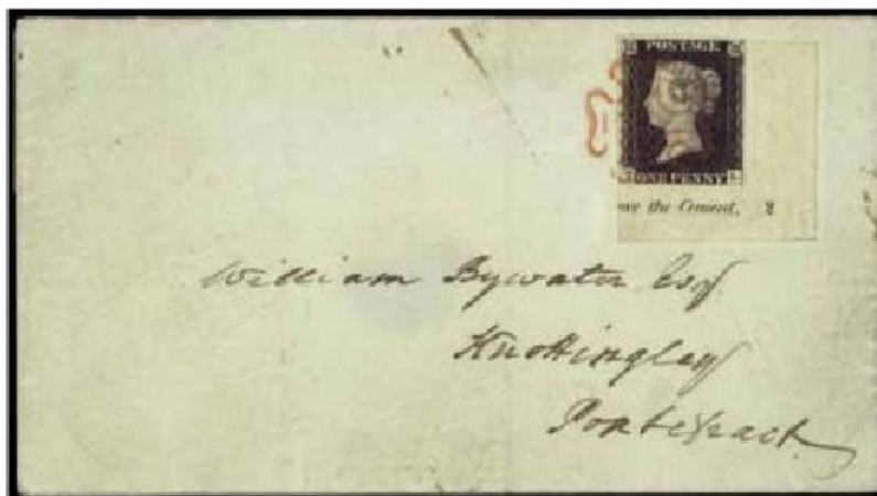
$556,045 in 2011: The world's most valuable Penny Black ever auctioned

What was described as the "finest and most attractive Penny Black cover in existence" sold for £348,000 ($556,045) in 2011, a world record for a Penny Black.