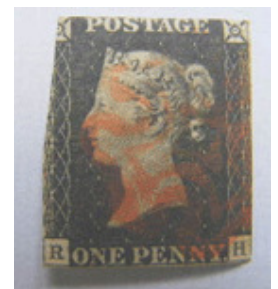
6 bids at time of viewing