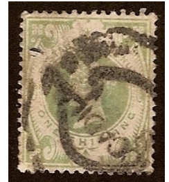
Described by seller as Fine used

I welcome comments and thoughts we can share so to help each other.