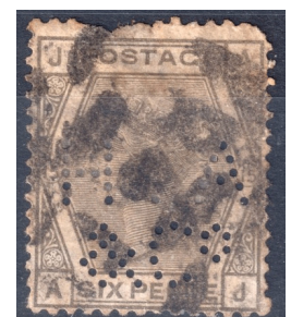
Not graded by seller,