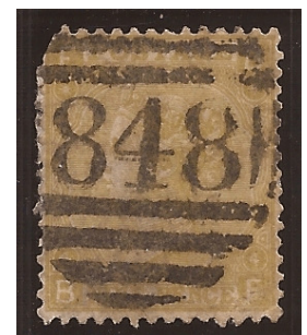
Described by seller as Good Used