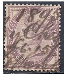
Described by seller as Used Nice