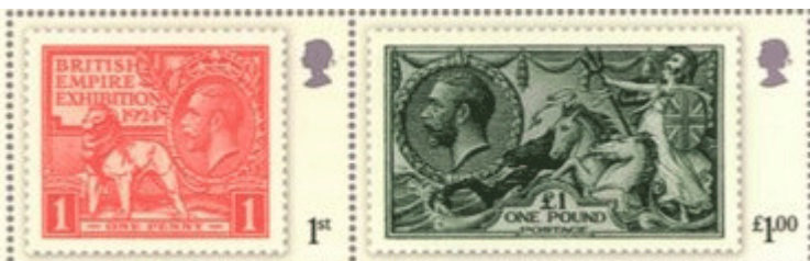
Top row from MS of 4 stamps. This will be the second miniature sheet, on sale on 8 May, opening day of the London 2010 exhibition. It will have stamps featuring the British Empire Exhibition stamps of 1924, ( the first GB commemoratives ) plus the 10s and £1 'Seahorse' high values.