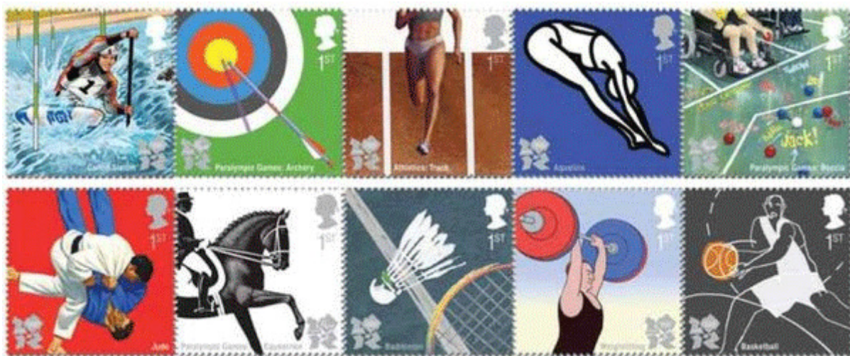
2012 London Olympic & Paralympic Games—22 October 2009

Royal Mail is working with illustrators and fine artists to create the stamps which will highlight both the sporting and cultural significance of this incredible event