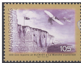
Hungary issue for 100th Anniversary of Blériot's historic flight across the English Channel — see also page 2