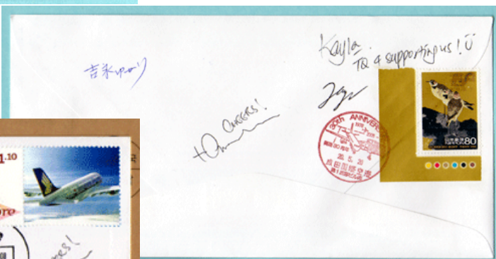
Left – My friends cover. Very nice don't you think.