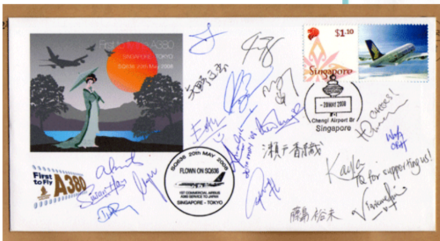
Backstamped as above