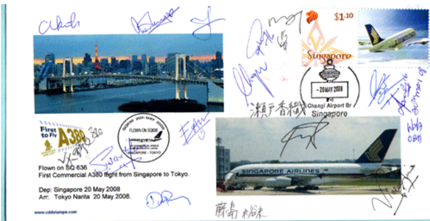
Above and to right – my cddstamps Cabin Crew signed cover – front and back – the Narita commemorative frank in red over the local Japanese stamp